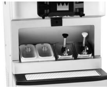
Integrated Syrup Rail Option - 2 room temperature with lids & ladles, 2 heated with syrup pumps

During long no-use periods, the standby feature maintains safe product temperatures in the mix hopper and freezing cylinder.