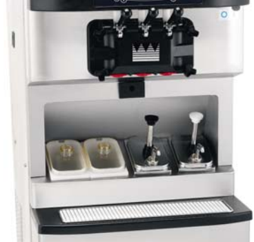
Integrated Syrup Rail Option - 2 room temperature with lids & ladles, 2 heated with syrup pumps

During long no-use periods, the standby feature maintains safe product temperatures in the mix hopper and freezing cylinder.