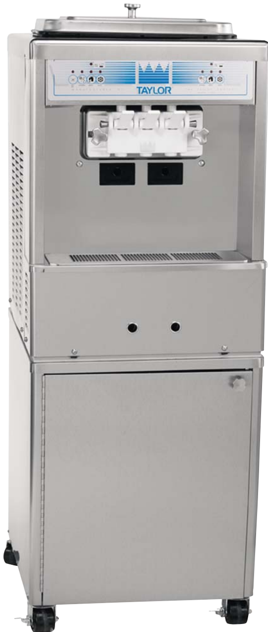
Photo shows Model 161 with optional cart

Easily removable, cleanable air filter helps keep condenser clean for optimal refrigeration system performance.